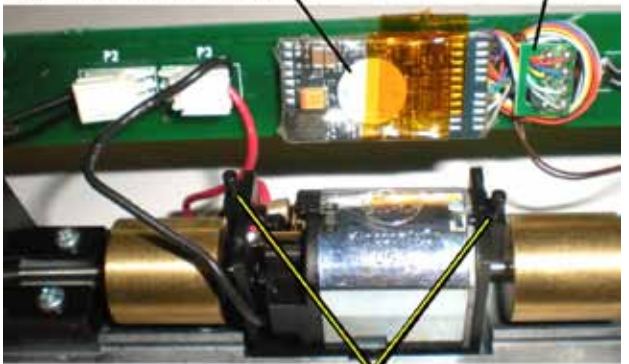
Remove (cutoff) unused post on motor supports

Using Kapton Tape or double side foam tape fasten the decoder module in place Plug in the decoder