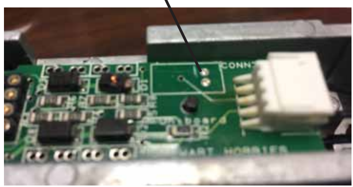
Solder motor wires

2 round solder spots after the slide lock removed