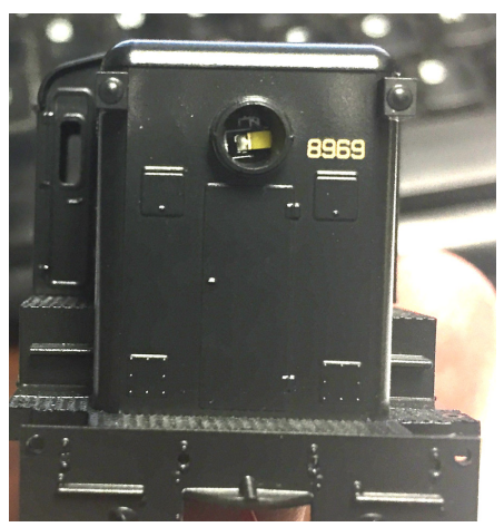
6. Glue or tape the circuit board with the LED centered in the light opening