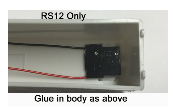
7. The RS 12 Headlight - glue the circuit board as photo above

8. Hold circuit board in place with Kapton tape or double side foam tape